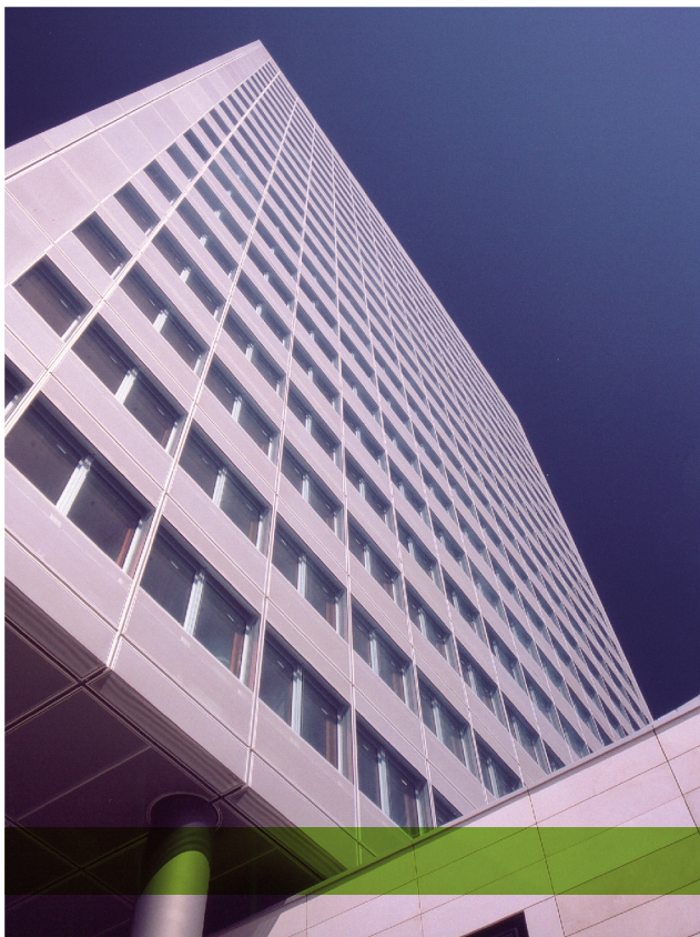
© 2011 Munich Re Königinstr. 107, 80802 Munich, Germany

The degradation of power output from crystalline photovoltaic modules over time is well-understood. Astronergy guarantees a power loss of no more than 10% of the original power rating within 10 years and no more than 20% within 25 years. Munich Re reinsurance underwrites these guarantees in order to reduce the potential risk for investors and customers of Astronergy's photovoltaic systems. If modules perform at levels below those guaranteed by Astronergy because of faulty manufacturing, material defects, or material aging; and in the highly-unlikely event that a catastrophic setback prevents it from honoring resultant claims itself, Munich Re will provide financial support and coverage to Astronergy for the full duration of the module warranty – 25 years.